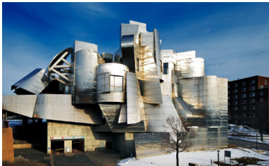
Weisman Art Museum