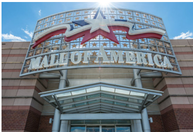
Mall of America