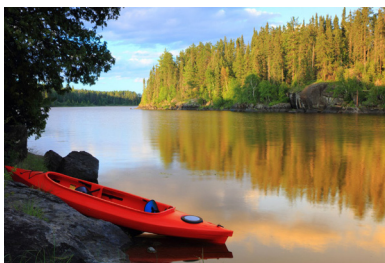
Land of 10,000 Lakes